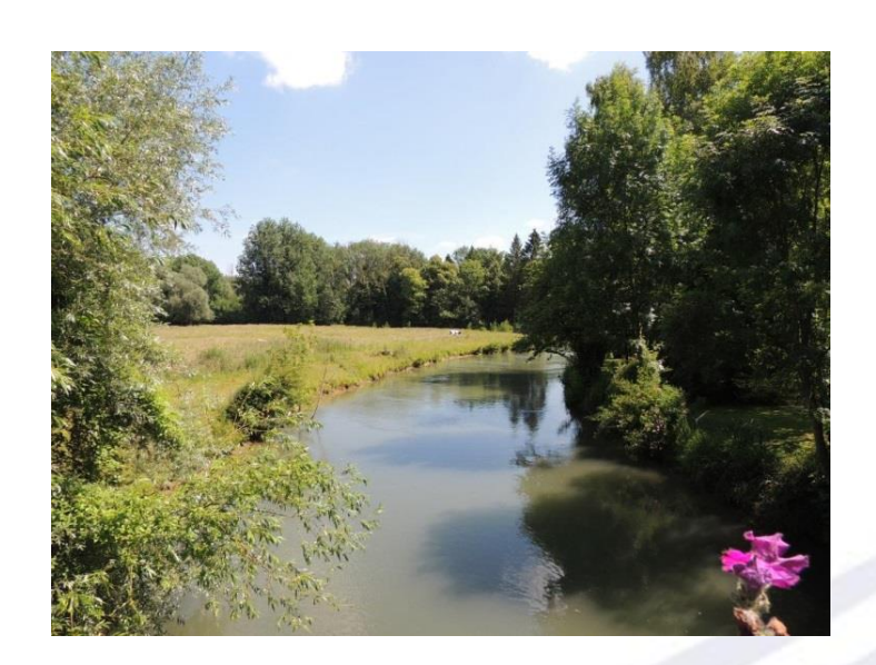
Artois Picardie web site: www.eau-artois-picardie.fr