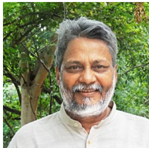
RAJENDRA SINGH INDIA

Water conservationist, Stockholm Water Prize winner and Founder, Tarun Bharat Sangh