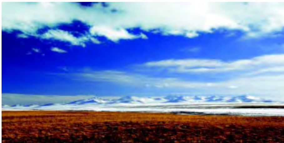
Scenery of the Yellow River